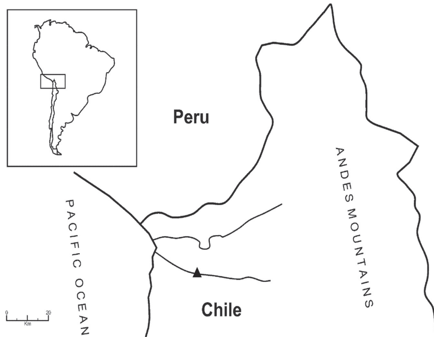
FIGURE 5. Geographic position of the first Chilean record of Homoeographa lanceolella (black triangle) in the Azapa Valley (18°31'S, 70°10'W), Arica Province.